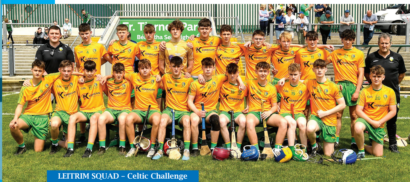
LEITRIM SQUAD - Celtic Challenge