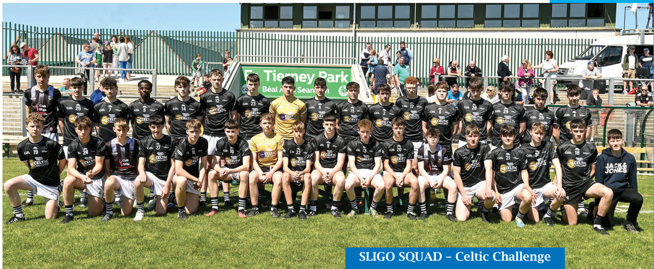
SLIGO SQUAD – Celtic Challenge