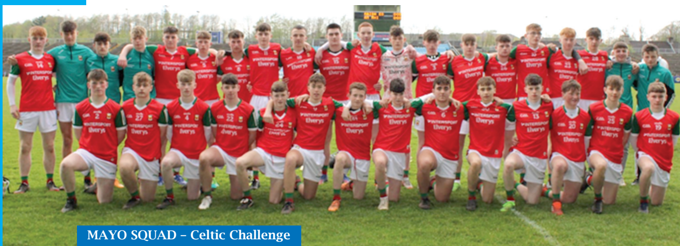
MAYO SQUAD - Celtic Challenge